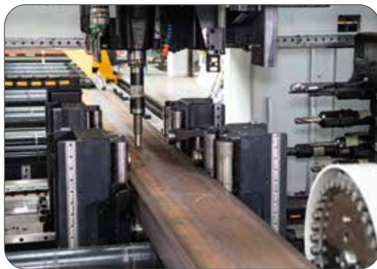
6-positions automatic tool changer

Vanguard drilling line combined with Nozomi coping robot