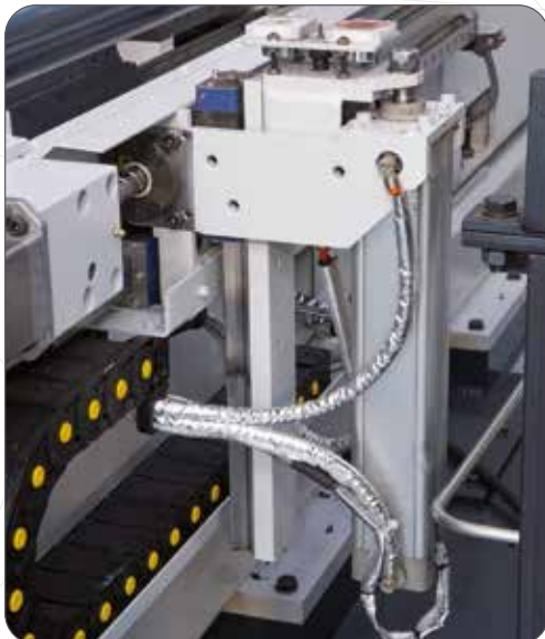
Underside web scribing device