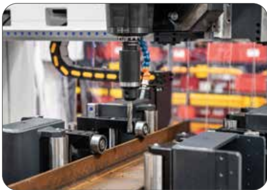
Vertical hold downs